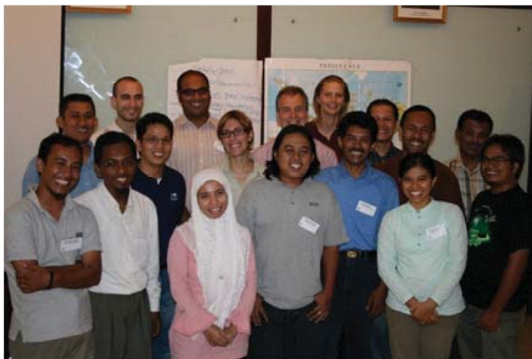
The photo on the right shows DRM participants from Nov 2008 DRM workshop held in Banda Aceh, Indonesia