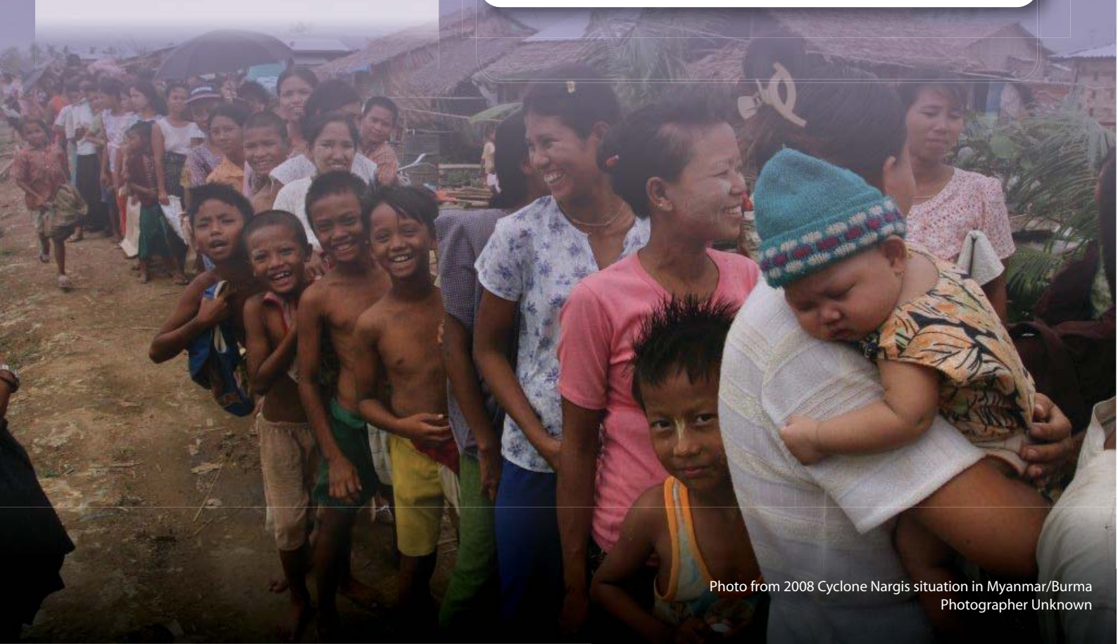
Photo from 2008 Cyclone Nargis situation in Myanmar/Burma

1. See p.4 of this brochure for more details