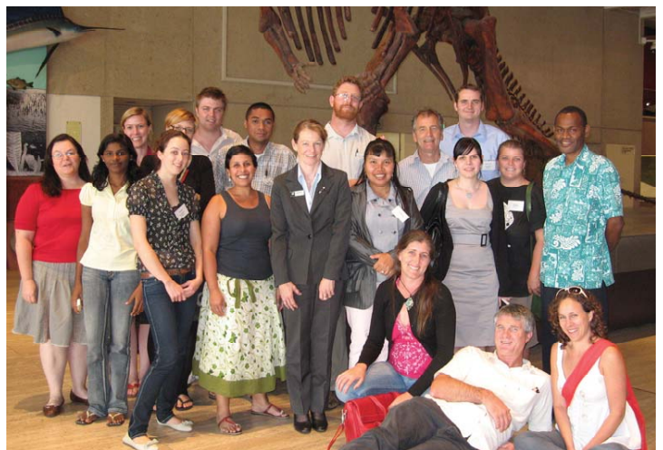
The photo on the right shows participants from a PPM workshop held in Brisbane, 2010