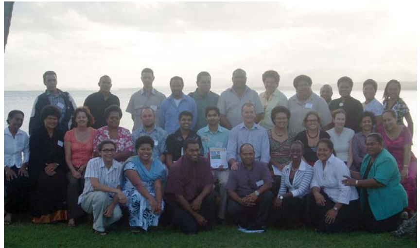
The Image on the right shows participants from a PPM Workshop held in Suva in July 2008